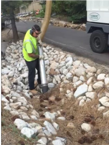
Washoe County Roads Crews use Tennant high efficiency vacuum assisted sweeper to clean roadside BMPs.

Annual operations and maintenance costs must be tracked as part of the Regional Transportation Plan Update.