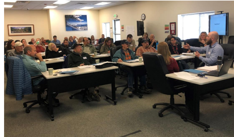
2018 TRPA Permit Review Training