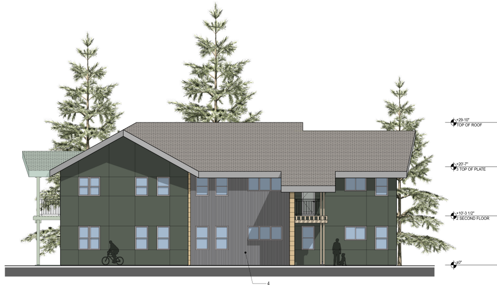
REAR ELEVATION - SCALE 1/8" = 1'-0"