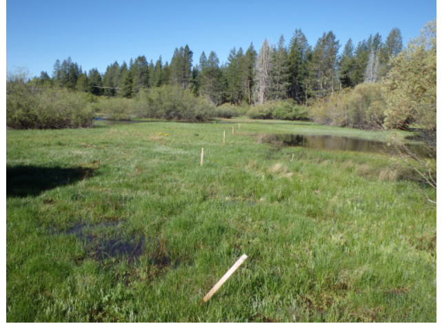
Trout Creek bridge alignment