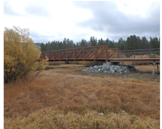
Bridge and boardwalk at Trout Creek

Completed and open to the public in fall 2021, the South Tahoe Greenway Shared Use Trail Phases 1b & 2 is the second implementation phase of the entire Greenway project, now named the Dennis T. Machida Greenway Memorial Trail. It expands on the existing bicycle network and connections in South Lake Tahoe. The approximately one mile shared use trail between Glenwood Way and Sierra Blvd, includes an elevated boardwalk near Trout Creek and Bijou Creek. A new bike bridge over Trout Creek, improves local street crossings, and connectivity to nearby amenities.