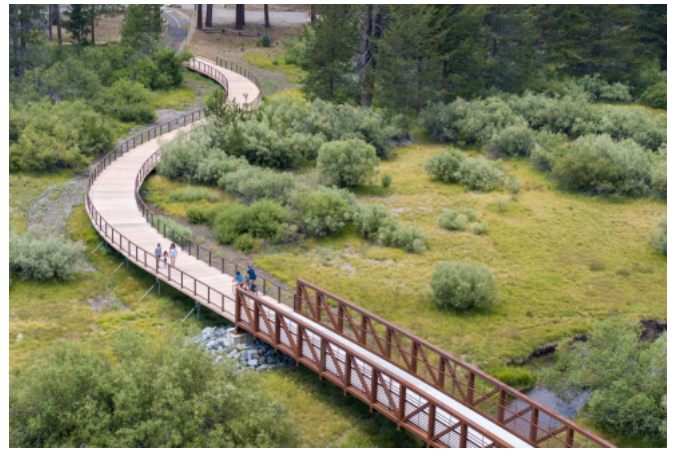
Dennis T. Machida Trail Trout Creek crossing