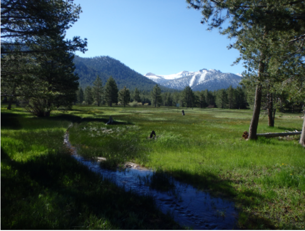
Bijou Meadow alignment