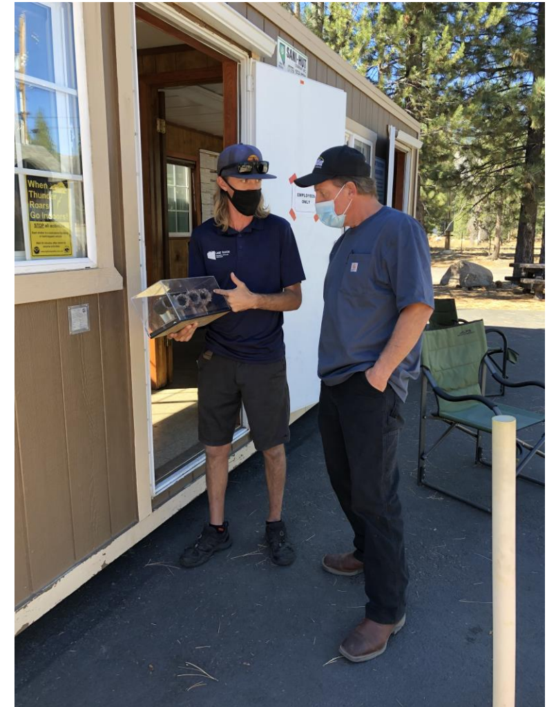
Agenda Item VIII.A