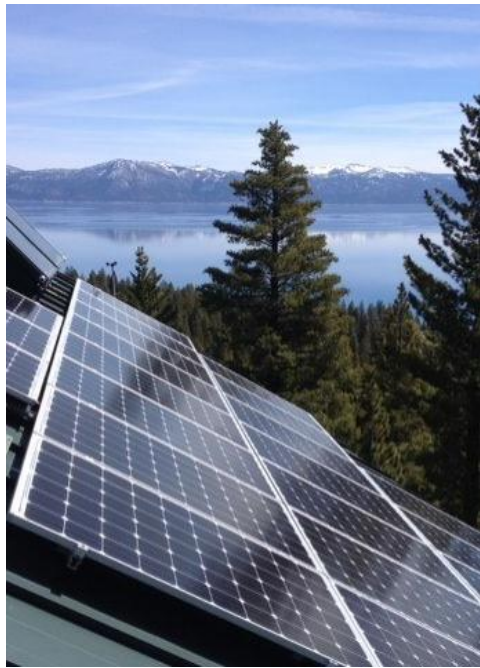
STPUD Solar Project