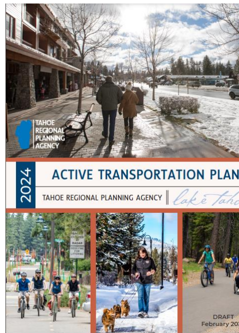
Active Transportation Plan