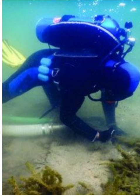
Three New Thresholds