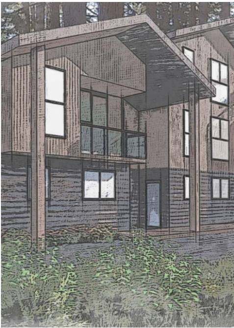
Phase 2 Housing Amendments